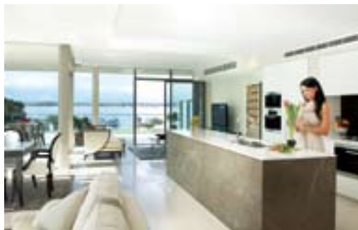
ESPLANADE, Nedlands WA

THE BROOKFIELD MULTIPLEX GROUP IS A FULLY INTEGRATED AND DIVERSIFIED PROPERTY BUSINESS.