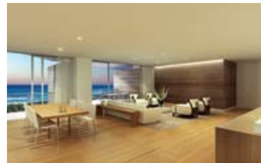
THE LEIGHTON, Leighton Beach WA*