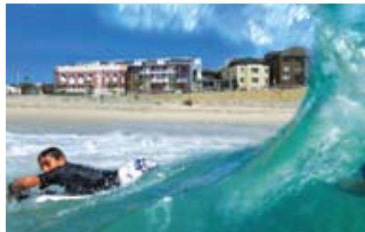
180 MARINE PARADE, Maroubra NSW*