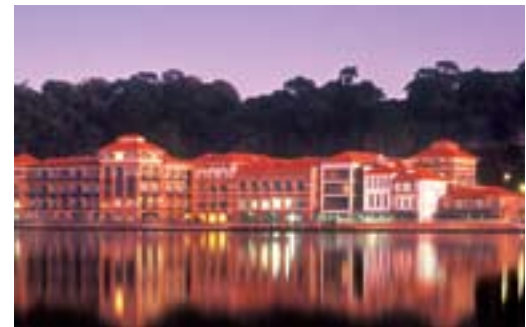
OLD SWAN BREWERY, Perth WA

As the Group's residential brand, Multiplex Living enjoys a reputation for excellence and innovation. It's no secret that we harbour a passion for living as well as for the creation and delivery of lifestyle enhancing residential projects. Put simply, we build places people love to live in. We also create exciting, sustainable communities that harmonise with their surrounds and provide their residents with rich and comfortable lifestyles.