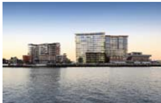
PORTSIDE WHARF, Hamilton QLD*