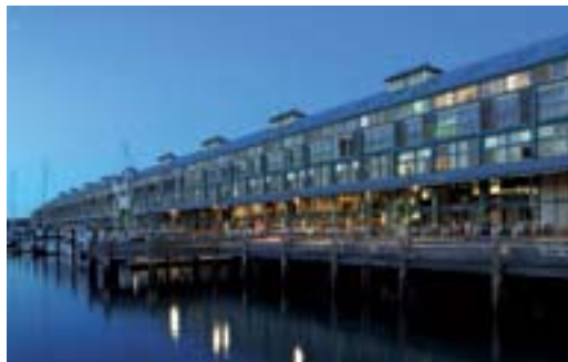
THE FINGER WHARF, Woolloomooloo NSW