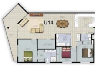
Unit 14 shown above Similar Units - 2 & 26