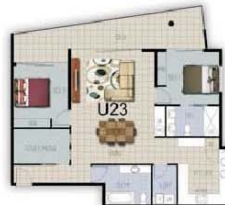
Unit 23 shown above Similar Units - 11 & 35