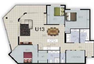
Unit 13 shown above Similar Units - 1 & 25