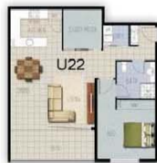
Unit 22 shown above Similar Units - 4 & 28 Similar Units (mirrored) - 6, 18 & 30