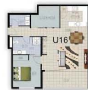
Unit 16 shown above Similar Units - 4 & 28 Similar Units (mirrored) - 6, 18 & 30