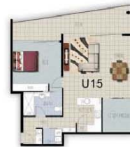
Unit 15 shown above Similar Units - 3 & 27 Similar Units (mirrored) - 5, 17 & 29