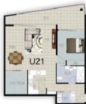
Unit 21 shown above Similar Units - 9 & 33 Similar Units (mirrored) - 7, 19 & 31