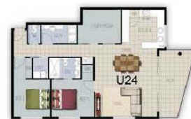
Unit 24 shown above Similar Units - 12 & 36